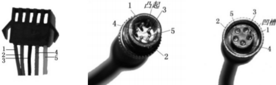
Connector to Controller Display Cable Outlet Connector Display Cable Coupling Connector

Note: Some products may use waterproof connectors, in which case the internal wire arrangements cannot be identified from outside.